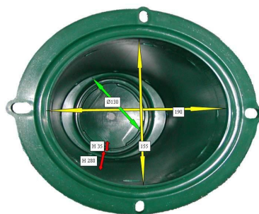
Small cap: dimensions