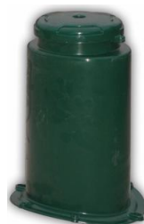
Small cap for single equipment (i.e. level gauge)