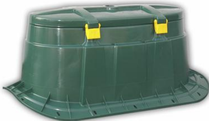
Cap for horizontal tanks*

The caps are equipped with nuts M6X20 and washers.